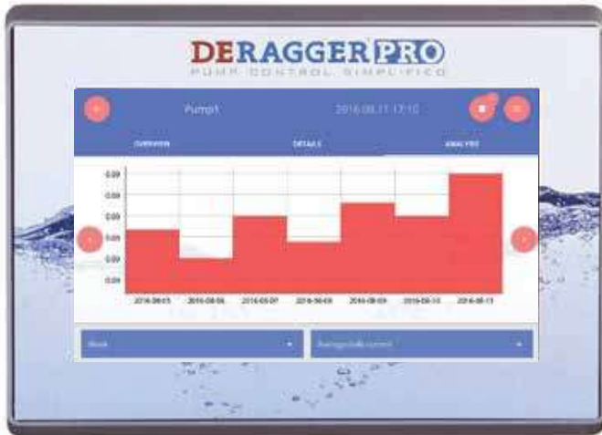
Pump Analysis Screen