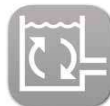
WET WELL CLEAN

Periodically cycles station to clear FOG and debris, eliminating 90+% of vactoring.