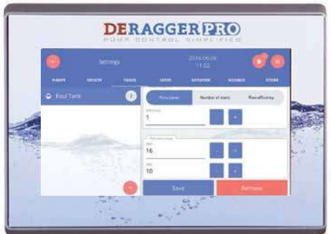
Tank Settings Screen

Provides trending data to show how equipment is performing.